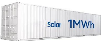
Standard 40ft containers