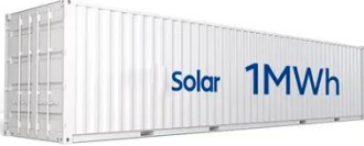
Standard 40ft containers

the safe and stable supply of electricity